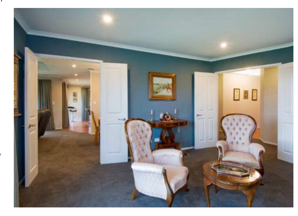
ABOVE Sliding stacker doors open from the kitchen to the substantial deck. BELOW The home has several double doors which can be left open to give the home an open, easy flow between rooms.

82 | Aug/Sept 09 | homestyle | Oct/Nov 09 | 83