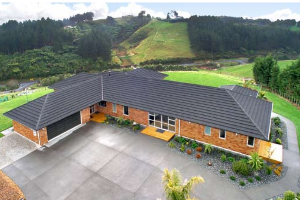
ABOVE Classic brick was chosen as the primary exterior cladding material. The homeowners wanted to use traditional products to eliminate future concerns, and also to ensure the home was comfortable in its rural surrounds. The Gerard Corona Shake roof profile blends well with the brick facade, in colour Charcoal.

craftsmanship exhibited. "You cannot beat traditional building materials, high quality fittings and fixtures, and classic workmanship," says Rob.