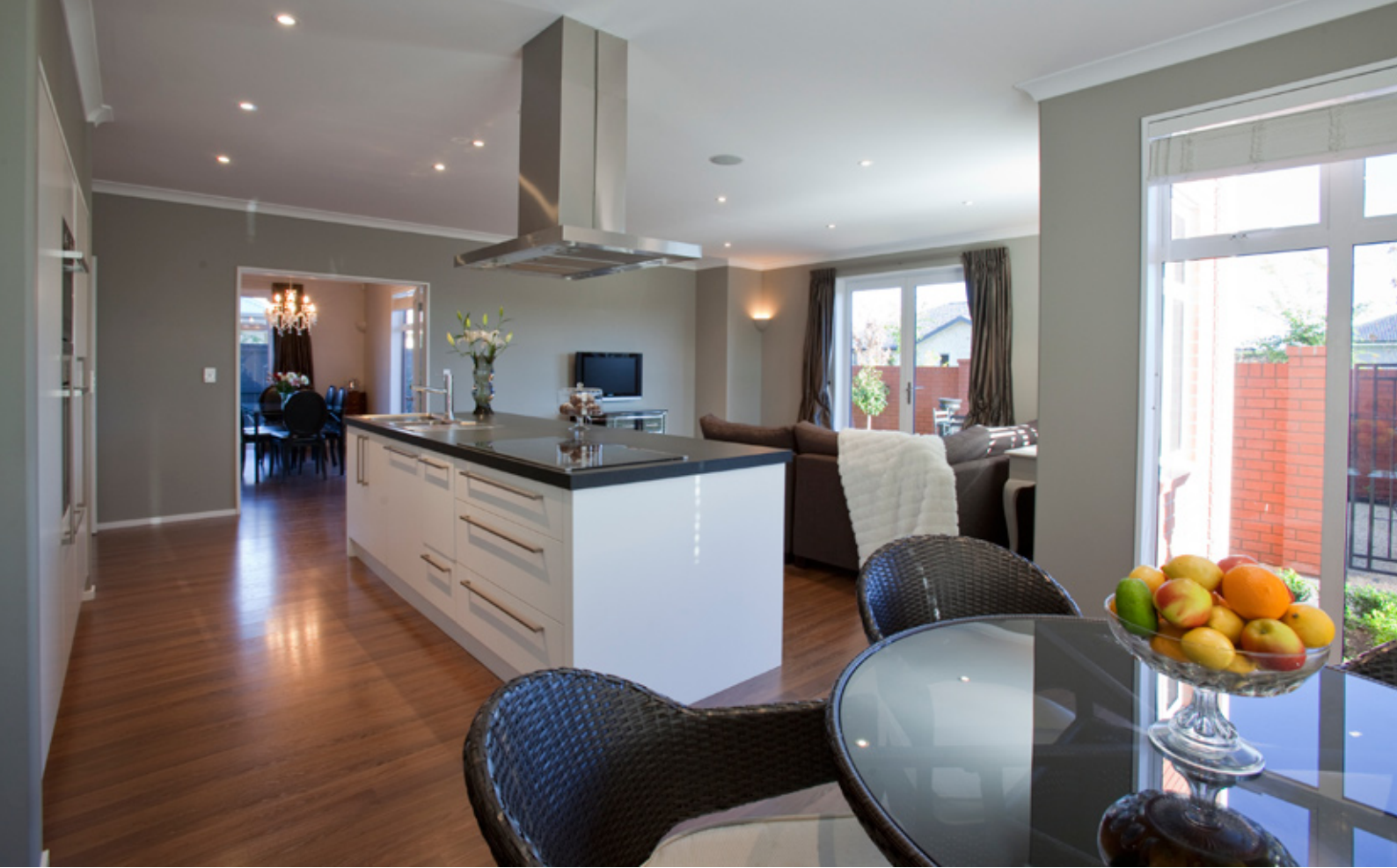
ABOVE The kitchen is modern and simple, with all the appliances hidden behind integrated doors, and the scullery located to the rear. A cafe area adjoining the kitchen is where the family eat casual meals together. BELOW A more formal dining space is located in the separate lounge, with views out over the garden.

The roofing profile chosen for the home is also exceptionally hardwearing, and was supplied by Monier Roofing . Trevor and Anne decided on the Horizon concrete roof tile, in colour Sambuca, because they liked the smooth, streamlined style which complemented the modern design of their home. Monier concrete tiles are made in New Zealand from local materials, and because they are formed from concrete they will